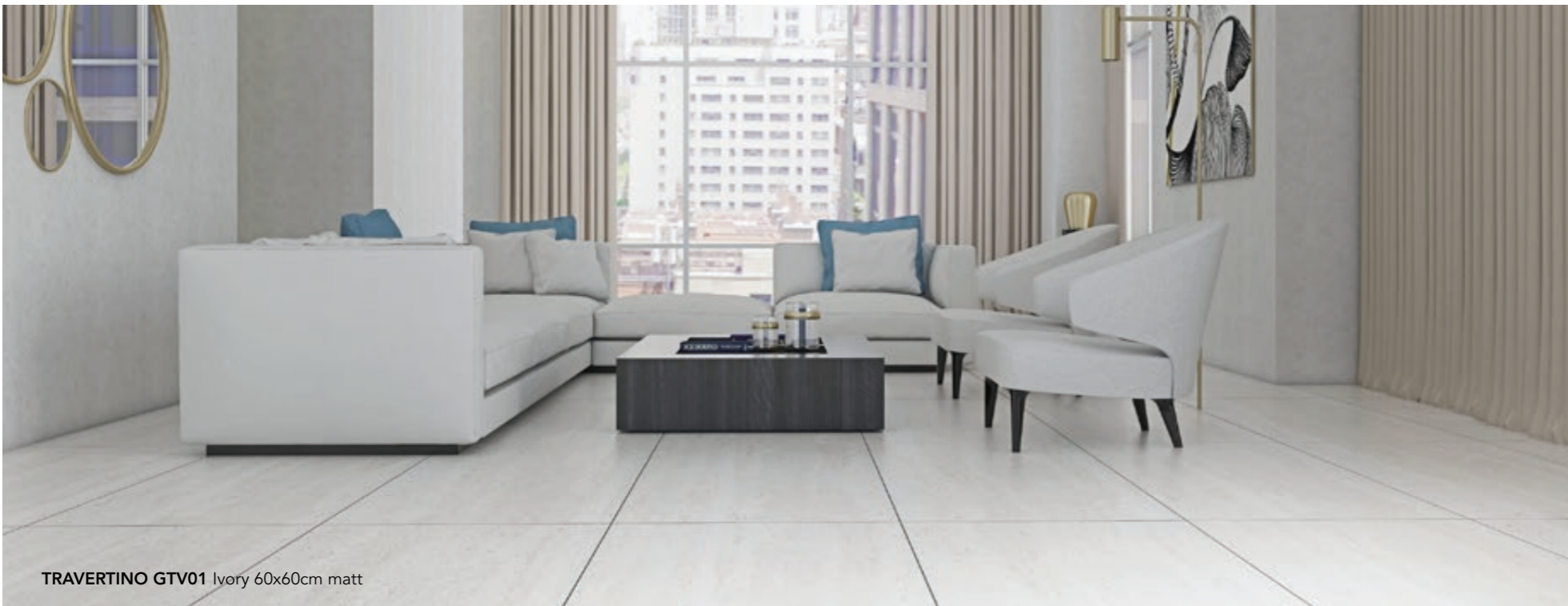
TRAVERTINO GTV01 Ivory 60x60cm matt