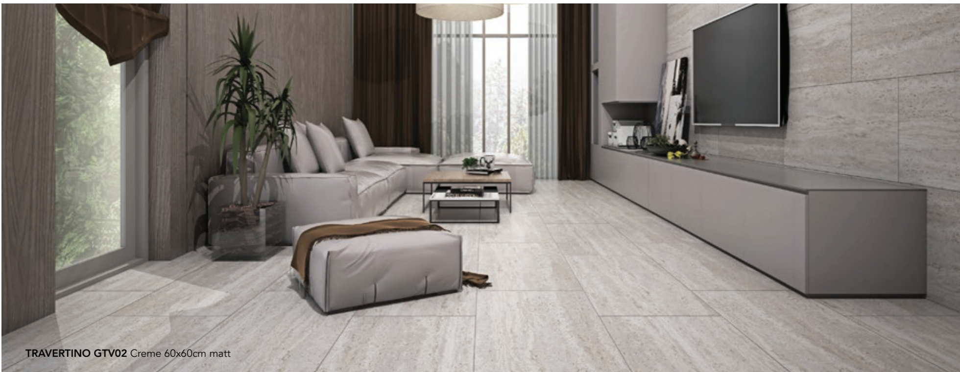
TRAVERTINO GTV02 Creme 60x60cm matt

*) Colour reproductions in this printed piece may vary from actual tile colors. Please view actual tile samples before making a decision.